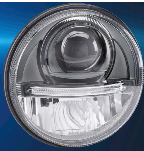
P/No. 72114 – High Beam and Direction Indicator Functions