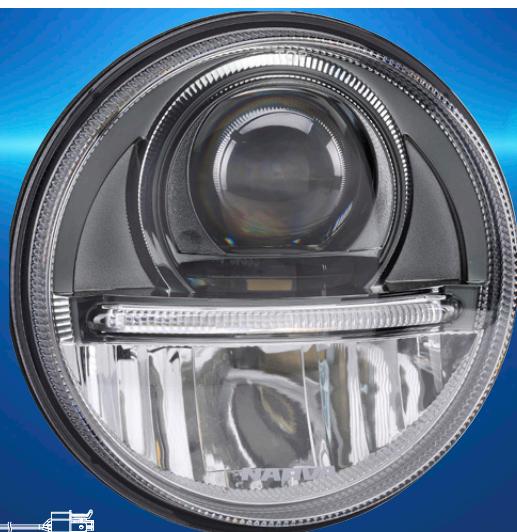
P/No. 72110 – High/Low Beam, DRL and Position Light Functions