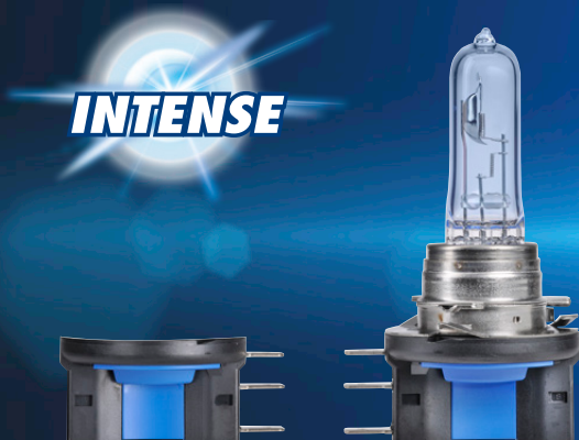
H15 P/No. 48096BL